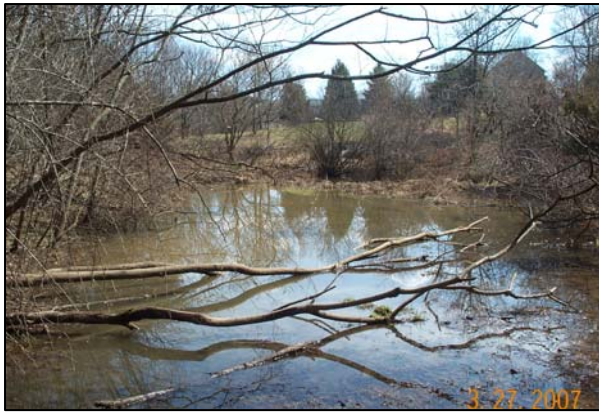
Poorly Maintained Detention basin at Country Acres

The NJWSA recommended retrofitting a detention basin at the Country Acres development into a constructed treatment wetland or a bioretention basin. The basin has not been maintained since it was constructed in the early 1980s. The outlet structure and berm are in poor condition and erosion is evident downstream. The homeowners of the property were highly motivated to rehabilitate the detention basin.