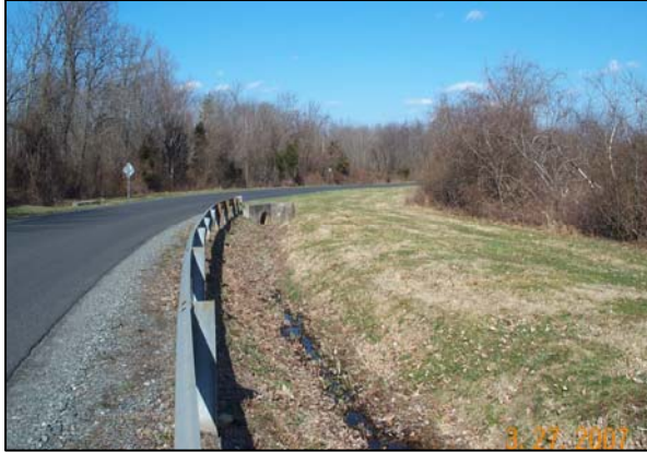
Existing Roadside Ditch

The highest priority site-specific project was to retrofit an existing ditch at the intersection of Van Syckel's Road and State Route 173 into a vegetated swale and wetland treatment system. The ditch showed signs of erosion and sediment deposition. The proposed retrofit would reduce runoff rates through detention and reduce runoff volume through infiltration prior to discharging to Mulhockaway Creek.