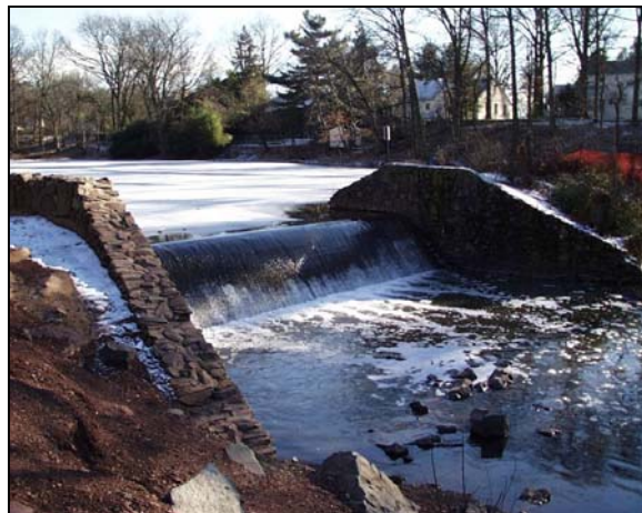
Ambrose Brook, Middlesex Borough

Phosphorus is a nutrient that can stimulate the growth of aquatic plants. In turn, aquatic plants can influence the extent of daily in-stream pH and dissolved oxygen variability resulting from photosynthesis and respiration. On May 1, 2008, at the NJWEA Annual Conference, and previously at the December TAC Meeting, Omni presented results of their model simulations to demonstrate what point and nonpoint source requirements would be needed at various locations throughout the Basin to satisfy NJ's Surface Water Quality Standards. Simulations were run under existing conditions, with various load-reduction scenarios of urban and agriculture land uses, and under natural conditions. Results of the modeling effort are being reviewed for the final report, including the establishment of point and nonpoint loading capacities. A data summary and past presentations are available at: http://www.omnienvironmental.com/ . Click onto Resources and scroll down to Raritan River Basin Nutrient TMDL Study.