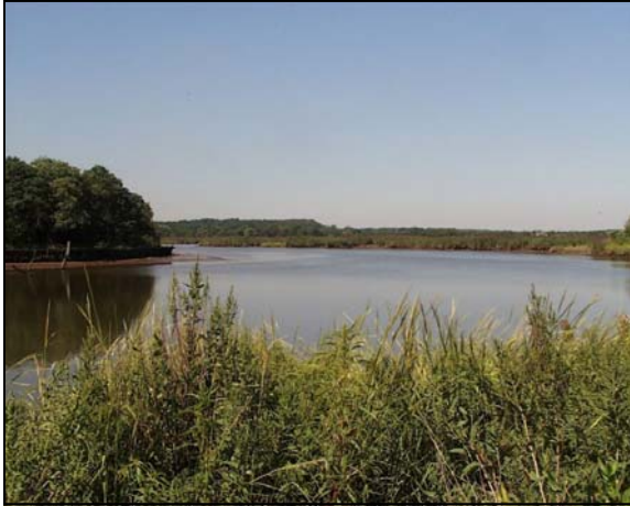
South River, Sayreville Borough