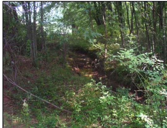
Eroded Outlet at Union Township Middle School

The retrofit of the stormwater management facilities at the Union Township Middle School was proposed to reduce runoff to the Creek and to improve water quality. The flow path through the wooded buffer at the School was eroded and there was substantial sediment deposition in the stream channel. Currently, there is no detention or infiltration on the property to control runoff from the highly impervious drainage area. The NJWSA recommended implementing bioretention swales and rain gardens on the property to improve the stormwater management. The retrofitted stormwater system would provide an excellent opportunity for education about stormwater, wetlands, and wildlife.